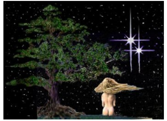
A Man A Snake A talking Snake with an Apple A women The Tree of Life The Serpent The Tree of Knowledge